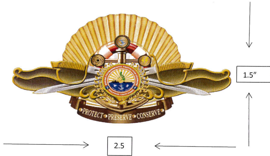
Figure 1. MEP Eligibility Badge in PCG Uniform ( Marlen, Bush Coat, Service Blouse, White Dock )